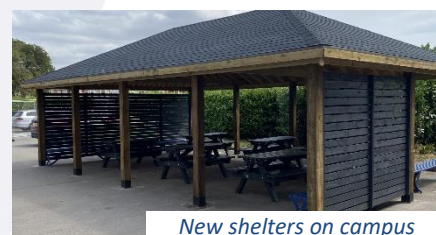
New shelters on campus

Ysgolion Cyfun Cymraeg Glantaf a Bro Eder