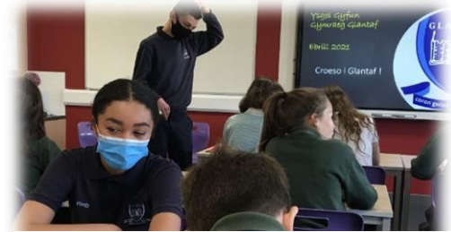
Yr 10 Workshop with Yr6 pupils at Y Wern

Our primary partnerships continued during the year, with virtual and face to face experiences. Year 7 held Question Time sessions with each Yr 6 class following their first few weeks at Glantaf. We started teaching live lessons to our cluster in Modern Foreign Languages: Yrs 6 (German) and Yr 5 (French), which will continue in September. We were able to visit Year 6 in their Primary Schools with a few Yr10 ambassadors in preparation for the transition period and we were delighted to welcome each pupil for two full days at Glantaf to enjoy secondary school life first hand, before they start in September.