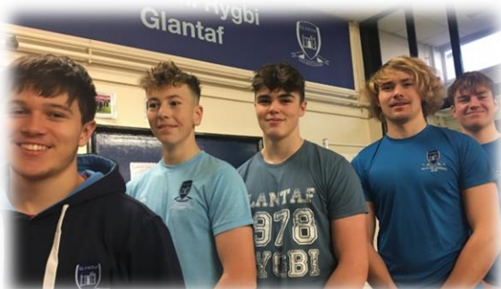
Glantaf Rugby Academy

We are always delighted to hear of the talented success and progress of our pupils, so please continue to share your successes with us as a school and our apologies if certain achievements are missing from the above list.