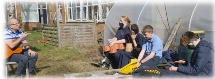
Outside Rehearsals for Eisteddfod T

We were pleased to see Sixth Form students enthusiastically supporting our '21 Challenge ( Mind Cymru ) in January as well as our Sponsored Walk "O Bont i Bont" from Pontypridd to Glantaf in the Summer Term to support Teenage Cancer Trust; British Heart Foundation and Cardiff food banks . It is a real pleasure to work within a community that looks outward, with compassion and goodwill, rather than those negative stories that so often reflect youth culture today.