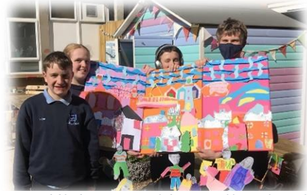
Eisteddfod T: Art work by Canolfan Glantaf Students

Although it has been a frustrating year in terms of school attendance, it has been a surprisingly busy year! In particular I delight at the creativity and willingness of staff and our pupils to engage in new ways of working, to look flexibly for solutions and to seek new ways of working and for supporting each other. At this time of report writing, looking back over the year's activities I would like to thank all school staff for their enthusiasm and creative energy for the benefit of our children and young people.