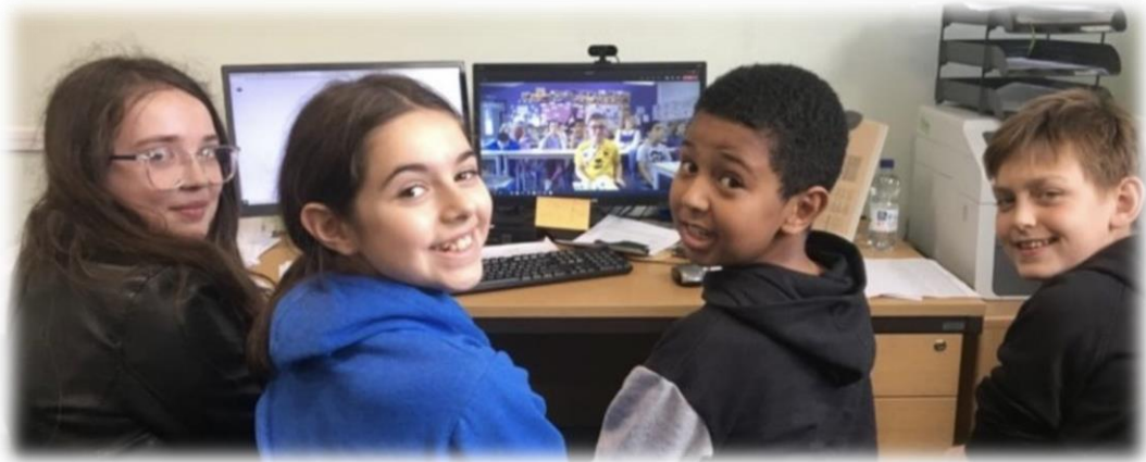
Year 7 hold a Question Time session with Yr 6 pupils