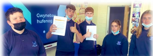
Yr 10 face the Dragons, Welsh Baccalaureate, Enterprise Module

GCSE / Vocational results in summer 2020 were excellent, with 86% of pupils gaining 5 A*-C and 50% gaining 5 A*-A qualifications; 75% of pupils achieved 5 A*-C including Mathematics and either English or Welsh and 98% of pupils achieved 5 A*-G. Due to the pandemic, data in comparison with other schools in Wales is not published. However, Glantaf's 2020 results correspond to the high standards in performance over the last four years and expected performance in comparison to similar schools.