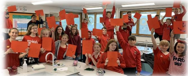
Show Racism the Red Card!