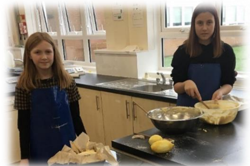
Baking Cakes on Digital Detox Day!