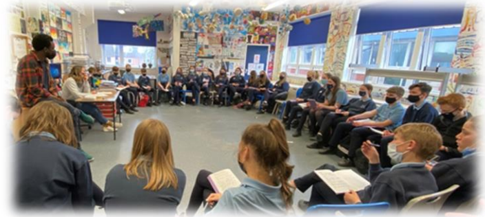
Yr 9 Creative Leaders, funded by the Arts Council for Wales

Unfortunately, Covid restrictions have frustrated our intentions to look again at our curriculum provision and pilot new courses for our students. However, we have included two new courses for KS4 pupils from Sept 2021, a Childcare and Outdoor Activity course which will extend our vocational offer for the future.