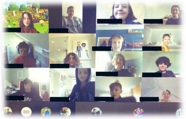
Glantaf Online Learning 2021: please switch on your cameras!

Unfortunately, this year will be best remembered for our extended sittings in front of our computer screens. Our shared experiences of Teams and Google Classroom have characterised our work and meant that although we stayed at home we have succeeded to continue with our learning experiences and educational provision. At Glantaf, "live teaching" was prioritised from the beginning with teaching moving on to Teams immediately when a group / year or finally the whole school was sent home to isolate. Keeping to the normal timetable (although reducing the