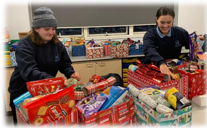
Fabulous support for our Christmas Hamper Appeal