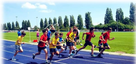
Athletics Lecwydd Stadium

We were delighted to continue our partnership with Cardiff Met Initial Teacher Training programme whereby we welcomed two cohorts of student teachers to Glantaf.