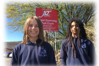
Year 10 visit Pwll Coch

Glantaf also works in close partnership with other Welsh Medium schools, both in CYDAG (Welsh Medium Schools across Wales) and with GYDA'n Gilydd (Welsh Medium Schools in Central South Consortium). One critical feature of our work this year was to hold strategic discussions with both Qualifications Wales and WJEC regarding extending the vocational offer for Welsh Medium Schools. Glantaf has been a key partner to establish working groups reflecting six key sectors of vocational learning: Business / Public Services / Sport and Outdoor Education / Tourism / Childcare and Creative Arts. These groups have representatives from WM schools across Wales and are working collaboratively with the WJEC and Agored Cymru to review current syllabuses to adequately reflect the needs of WM learners for the future.