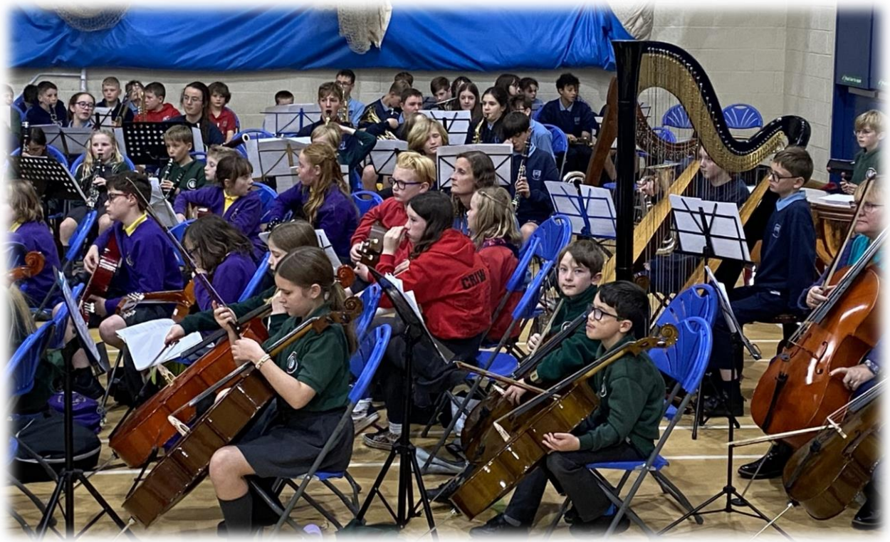
Glantaf Cluster Orchestra Yr 4 - Yr 13