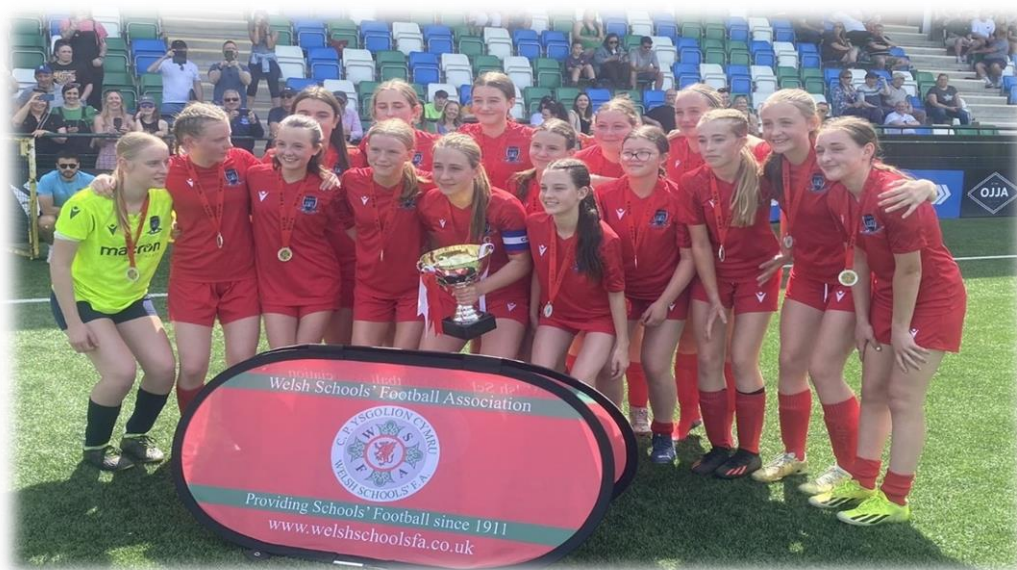
u15 National Football Champions

Ysgol Gyfun Gymraeg Glantaf is a Welsh Medium Comprehensive School in Cardiff City and County Borough Council. The curriculum is offered through the school entirely in Welsh in KS3, KS4 and in KS5.