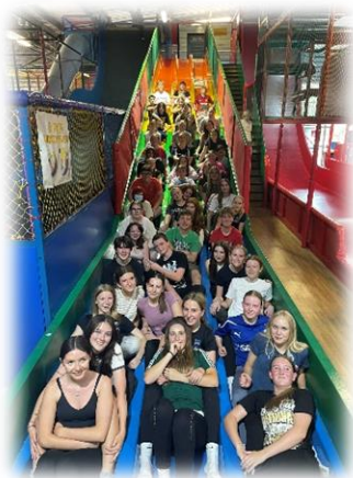
Yr10 end of year excursion