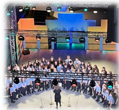
Glantaf Folk Choir at the Cerdd Dant Festival

We were delighted to welcome visitors and partner organisations to school which included: