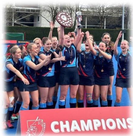
Welsh Champions u18 Hockey

A copy of the school calendar is available to parents annually from September or through the main school office on 029 20 333090