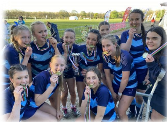
Yr11 National Rugby Urdd 7 a side Champions