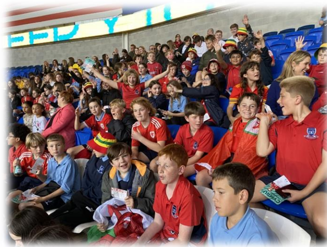
Yr7 Supporting Cymru September 2023