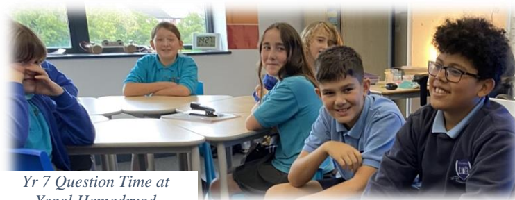
Yr 7 Question Time at Ysgol Hamadryad