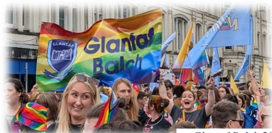
Glantaf Balch 2024

We have also been delighted that our Balch group (LGBTQ+ pupil group) have met regularly and enjoyed participating in the annual Cymru Balch Celebration Event in Cardiff in June 2024.