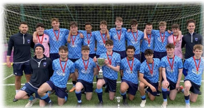
Welsh Champions u18 Football