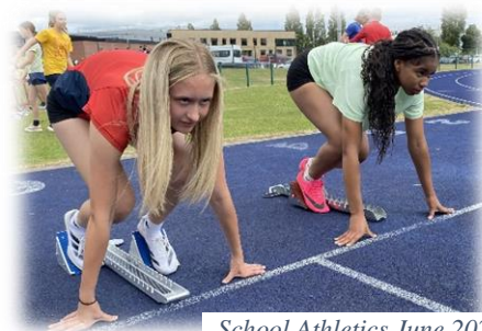
School Athletics June 2024

Glantaf has continued to prioritise investment in Digital Technology by providing pupils with a personal Chromebook. Through Cardiff City Council investment, we have been able to provide a personal device for every pupil from Year 8 to Year 11. This significant investment has allowed us to review our curriculum and fully integrate digital skills into pupils' learning. Although funding for this scheme will cease for 2024/25,