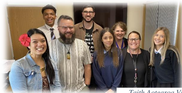
Taith Aotearoa Visit