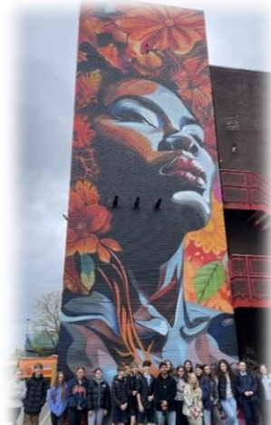
Yr9 Street Art Project with Unify

The Taith Aotearoa visit highlighted the need for a deeper commitment and sharper focus on our Cwricwlwm Cymreig as well as nurturing a feeling of engagement and belonging (perthyn) to both school and Welsh identity.