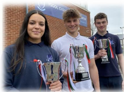
Urdd 7's National Cup Champions