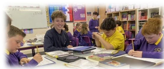
Glantaf transition visit