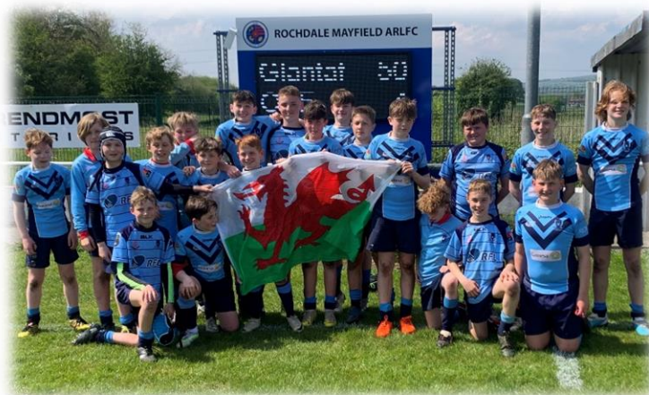
Yr7 Rugby League UK Semi Finalists on their way to Wembley!