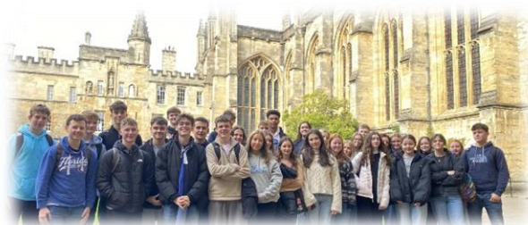
Glantaf visiting New College, Oxford