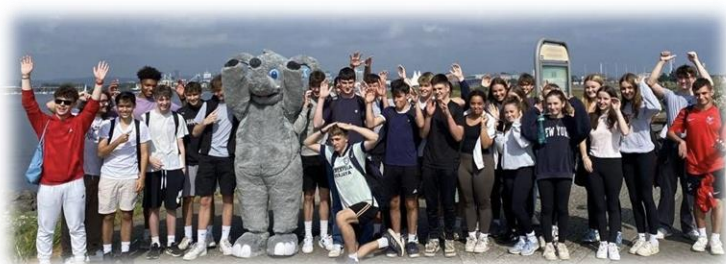
6th form sponsored walk - 2Wish

This is an important feature of our work at Glantaf and we are proud of our charity events.