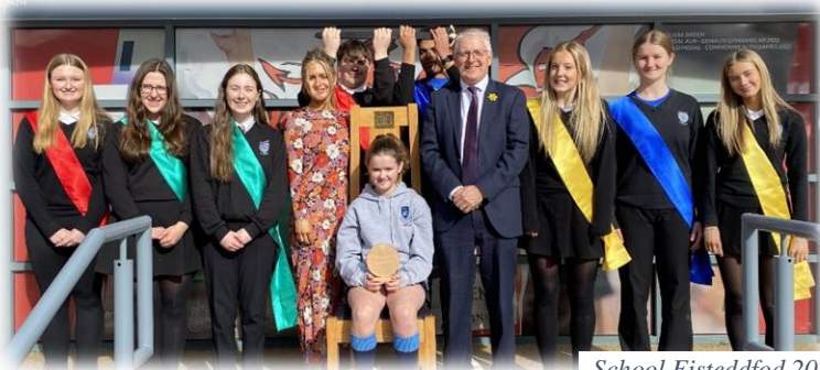
School Eisteddfod 2024