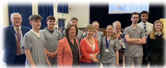
Medicine and Dentistry Conference for Welsh Medium Schools at Glantaf

We continued partnership work with other Welsh Medium schools in South Wales (CYDAG) in an INSET day which focussed on sharing good practice. In November, Glantaf staff joined colleagues from across 20 schools in training on areas such as Leadership; Wellbeing, Skills; Curriculum for Wales and Assessment.