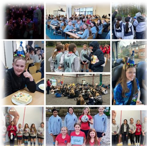
Yr7 Netball Trip to Liddington