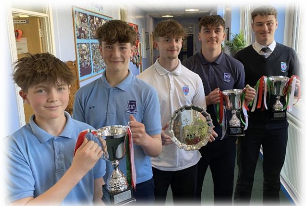
Urdd Rugby 7's Tournament Success