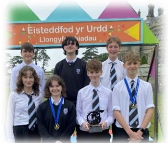
Gold for Jazz Band Ensemble