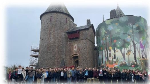
Year 11 Sponsored Walk