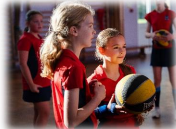
Sport at Glantaf

Personoliaeth Chwaraeon Hŷn y Flwyddyn Personoliaeth Chwaraeon Iau y Flwyddyn Gwobr Jan Robinson Gwobr Dai Williams Gwobr Peter Manning Gwobr Gaynor Jones Gwobr Brenda Goodfellow Gwobr Keri Evans Gwobr Malcolm Thomas