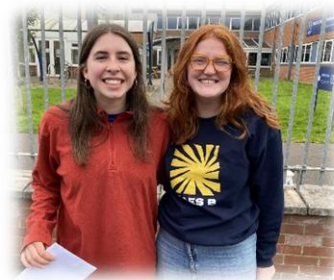
A Level Results Day 2024

Yr13 also celebrated well-deserved grades with several pupils who performed excellently. The outstanding results recorded meant that 43% of all grades at A Level were A* or A and that of the 410 grades awarded, 281 of them were of the highest grades B > A*. This meant that all pupils in Yr13 succeeded in securing their preferred place in their first or second choice of higher education. It was pleasing that so many of our pupils (57%), achieved the A*/A grade in the Welsh Baccalaureate qualification.