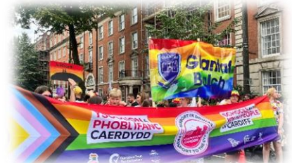
Balch Caerdydd, Meh 2025

We have also been delighted that our Balch group (LGBTQ+ pupil group) have met regularly and enjoyed participating in the annual Cymru Balch Celebration Event in Cardiff in June 2025.