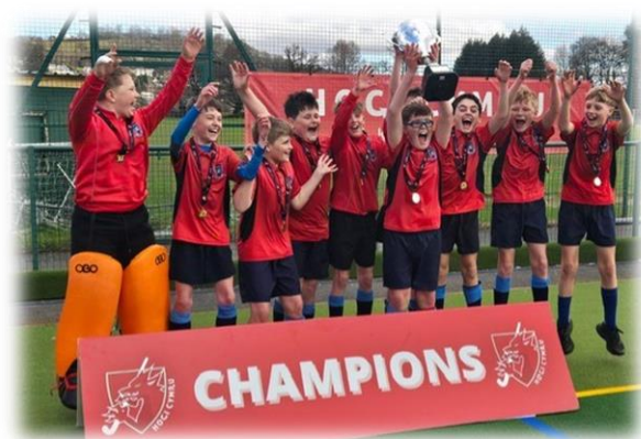
Jumping for Joy: Yr7 Hockey team celebrate Welsh Cup win

Ysgol Gyfun Gymraeg Glantaf is a Welsh Medium Comprehensive School in Cardiff City and County Borough Council. The curriculum is offered through the school entirely in Welsh in KS3, KS4 and in KS5.