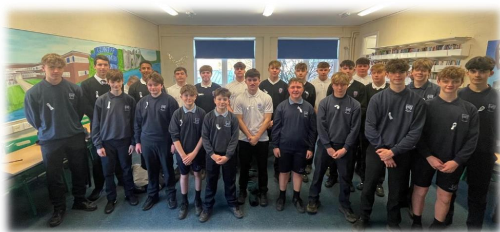
Boys Choirs on White Ribbon Day