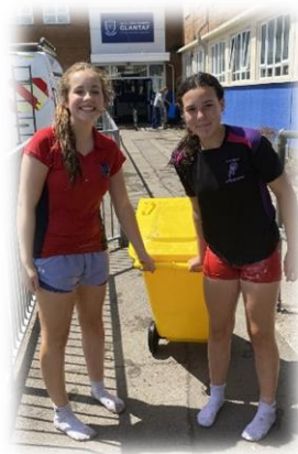
Gwyl Glantaf 2024

Sponsored walk for Felindre Hospital Christmas Hampers for local families Staff Cluster MacMillan Coffee Morning National Autistic Society Welsh Women's Aid Merched y Môr, Girls challenge Red Card to Racism awareness World Book Day awareness International Women's Day awareness