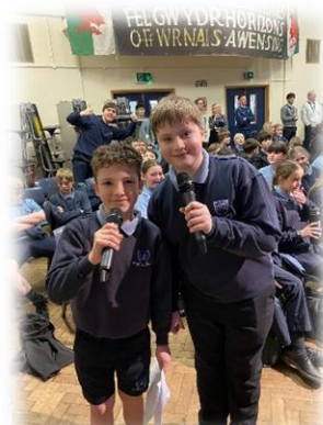
Battle of the Bands 2025

Good Friday, 3 April 2026 Easter Monday, 6 April 2026 May Day, 4 May 2026 Spring Bank Holiday, 25 May 2026