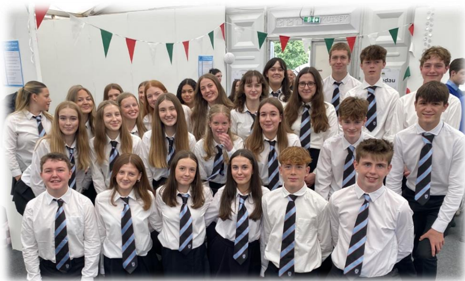
Backstage with the Folk Choir: Eisteddfod Margam