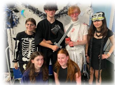
Year 7 Halloween Disco 2024