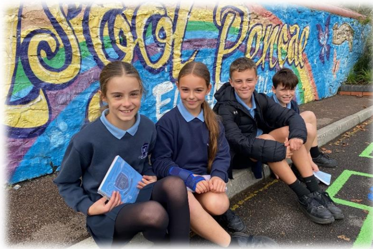
Yr 7 Question Time session at Ysgol Pencae