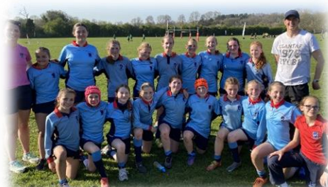
Girls Rugby Teams Urdd 7 a side championship

We are always delighted to hear of the talented success and progress of our pupils, so please continue to share your successes with us as a school and our apologies if certain achievements are missing from the above list.