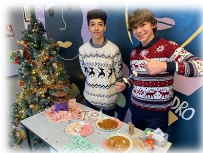
Yr10 Christmas Fayre, Enterprise Challenge

During 2024–25, there has been a significant improvement in the provision for reading across the curriculum at Key Stage 3. Almost all departments have developed appropriate strategies to develop reading skills among pupils, ensuring that reading is a key part of the learning experience. This progress has been identified through self-evaluation, and has led to increased engagement with challenging texts and increased awareness of the purpose of reading at all levels. However, this work will continue in 2025–26 with a specific strategy, giving each year group a clear reading focus in line with the needs of their learning stage. The development of extended writing is now fully incorporated into our practices. Pupils receive regular opportunities for extended writing, with effective methods of giving feedback and time allotted to making improvements.