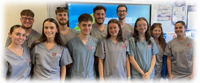
Medicine and Dentistry Conference for Welsh Medium Schools at Glantaf

In summer 2024 we saw the first GCSE results of the new courses we established two or three years ago. These new courses saw pupils' success at the end of Year 11 in Outdoor Education, Sports Coaching; Child Development and Graphics. This has seen an increase in our Capped 9 score as more pupils were able to succeed within a broader range of subjects.