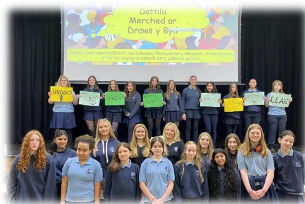
International Women's Day Assembly

This work will directly feed into the School Improvement Plan, strengthening Welsh identity, promoting girls' confidence in leadership. We look forward to welcoming students from Malaysia to Wales in 2026 as part of an ongoing and inspiring partnership