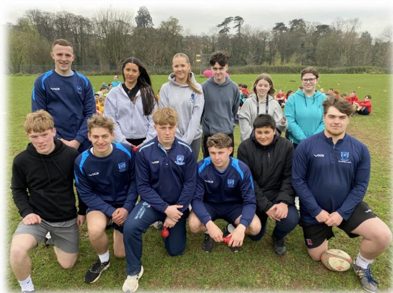
Year12 Coaching at multi-sport tournament

A copy of the school calendar is available to parents annually from September or through the main school office on 029 20 333090