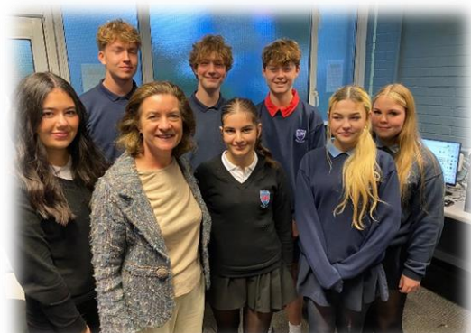
Prif Weinidog, and former Glantaf Pupil, Eluned Morgan AS with Glantaf students at Gabalfa Youth Club