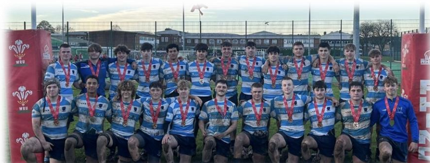
2XV Champions of National Schools and Colleges League