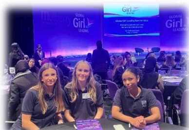
Glantaf at Global Girl Conference 2024