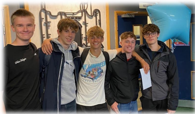
GCSE Celebrations 2024