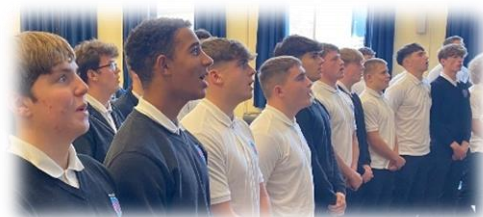
Glantaf Male Voice Choir: October 2024

It is a pleasure to present this annual report to the school community of Ysgol Gyfun Gymraeg Glantaf. I feel privileged to work alongside such talented pupils and committed staff members within teulu Glantaf .