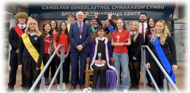
School Eisteddfod February 2025