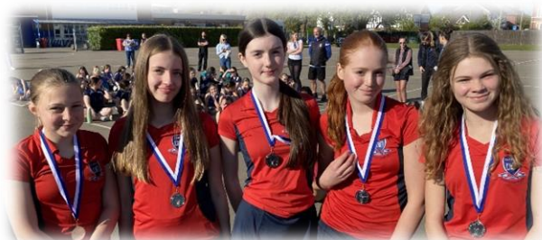
County netball tournament Glantaf 2025