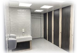
New toilet blocks, Sept 2024

Further investment on campus has included new leisure facilities on campus with the addition of a basketball pitches and outdoor table tennis. We funded the upgrading of three toilet blocks (circa £150,000) which has transformed our facilities for pupils. We are also delighted that significant investment from the authority has meant a brand new boiler system servicing the PE and Science blocks. We have also upgraded and refreshed several of the school corridors to include some beautiful murals and included some professional images of the natural beauty of Cymru and the local area. We increased the number of our chilled water fountains, laid new carpets and invested in new school signage as “Ysgol Hyfforddi” (Training School), encouraging enquiries from the community regarding opportunities to train as teachers, learning support or support staff at Glantaf. We were also delighted to install a new Music Studio which has been well received by our school bands.