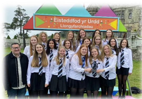
Senior Cerdd Dant Group: Gold Medal at Margam!