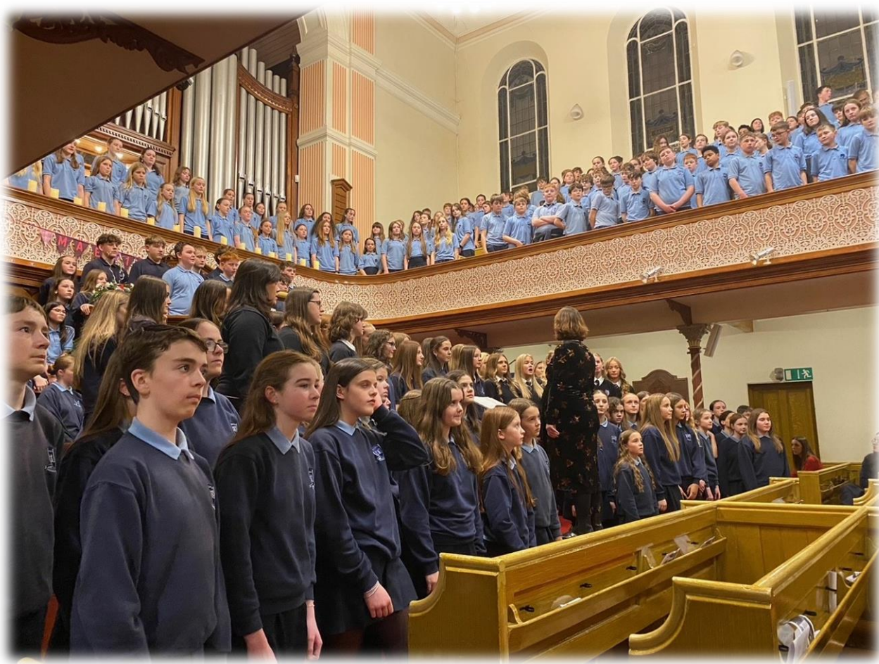
Glantaf Choir: Christmas Concert 2024