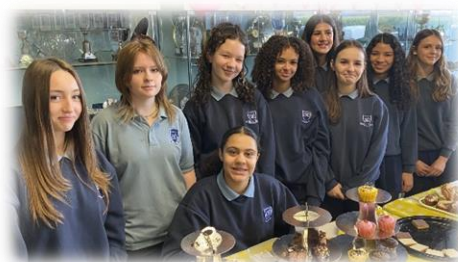
Yr 9 Girls cake stall for Merched y Môr