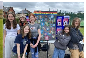
Gwyl Glantaf 2024