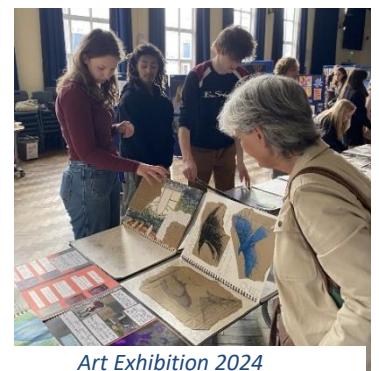
Art Exhibition 2024

South Africa Tourists and residential visits – We wish our Senior Students well on their South Africa Tours over the next few weeks. We also thank the History Department for the rich experiences for Yr9 on their recent visit to Belgium and France. We also welcomed the pupils from the Canolfan back from their residential activity trip to Liddington this week.