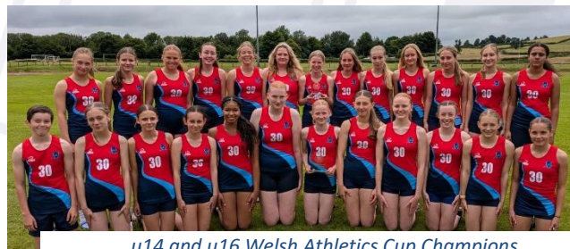
u14 and u16 Welsh Athletics Cup Champions