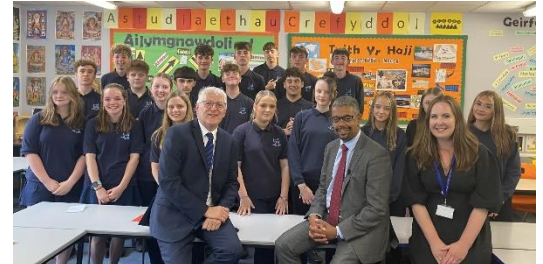
Prif Weinidog Q&A with Yr10 Welsh Bacc students

029 2033 3090 ysgolgyfunlantaf@caerdydd.gov.uk www.glantaf.cymru