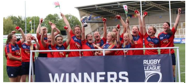
UK Champions - Glantaf girls once again grab the headlines!

Last week, our u14 Girls Rugby League team had a notable victory in the UK Cup final and are therefore the first Welsh women's team to achieve this result. They were then presented to the crowd at St James' Stadium in Newcastle during the Rugby League Champions Cup! Congratulations to the whole team for their tenacity, character and fitness to succeed at this level: gwych ferched! Congratulations and thanks also to everyone who ran the Race for Life at Bute Park over the weekend and raised money for such an important charity!