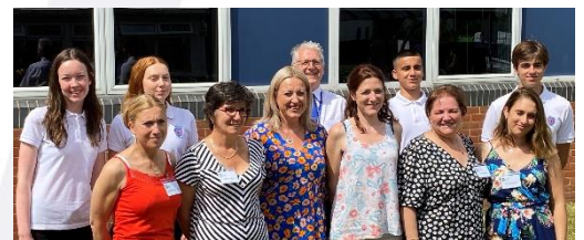
Academie de Creteil visiting Glantaf

We were pleased to welcome teachers from Paris on a visit to Wales to understand bilingual teaching and promoting language learning this week. It was an excellent opportunity for our Sixth Form students to practise their French language skills!