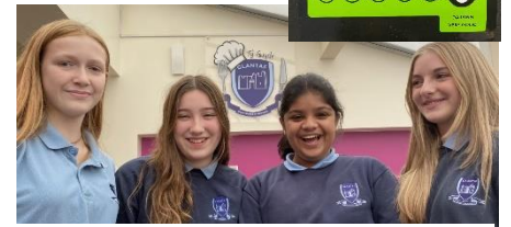
Happy pupils and our new canteen logo