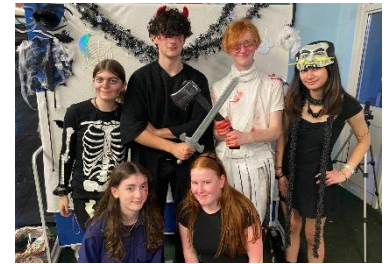
Halloween Disco fun 2024!

As we approach the end of our first half term, I would like to express my sincere thanks for the excellent work of pupils and staff here at Glantaf through a busy and productive start to the academic year. It's already been a whirlwind of activity – fundraising events, educational visits, wellbeing workshops as well as pupils taking part in sports and extra-curricular clubs. Many thanks to the charity Show Racism the Red Card for providing important educational workshops for our Year 7 pupils, promoting equality and combatting prejudice.