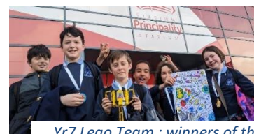
Yr7 Lego Team : winners of the innovation prize!

Reports and Examinations - Yr 9&13 full reports as well as interim reports are being published for all pupils this week. GCSE and A Level practical examinations have also started with all pupils receiving their individual examination timetables this term. Please check these carefully for accuracy as they include all the examination registrations for each student. GCSE and AS examinations start on the 12 th of May with the last day of teaching for Yrs 11&12 on Friday 12 th of May. Please be advised that Yr12 will return to classes following their examinations on Monday the 12 th of June.