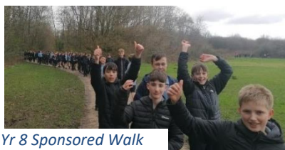
Yr 8 Sponsored Walk March 2023

Wales Children's Hospital Year 8 sponsored walk - An impressive £800 was raised by our Yr8 students in a sponsored walk to support the Noah's Ark Appeal : Children's Hospital for Wales. Da iawn chi!