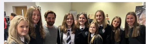
Meeting Wales Centre Joe Allen, before the big match at Cardiff City Stadium

I would like to thank you for your support in keeping high standards of school uniform. I would wish to remind you that school shoes and socks should be black without a branded name or logo. Short trousers should have the school logo, and may be worn throughout the year. Pupils should wear knee length skirts, with pleats. Please remember that our free uniform site for sharing or requesting